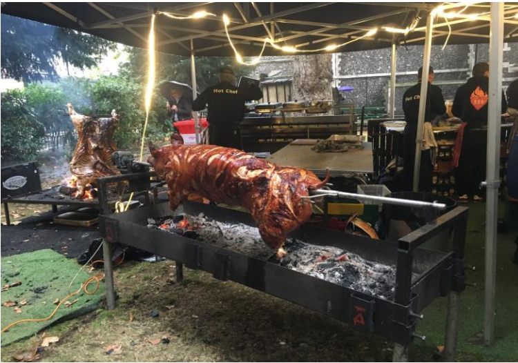
Hog Roast in St Bartholomew the Great's Churchyard