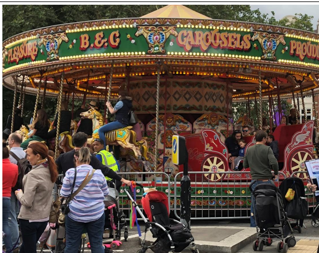
The carousel in West Smithfield was a popular attraction

On Saturday the weather co-operated, people came in numbers and there was a tremendous atmosphere. Unfortunately, the weather was not so kind on Sunday, but there was still plenty to enjoy. We hope that those of you who came had a good time!