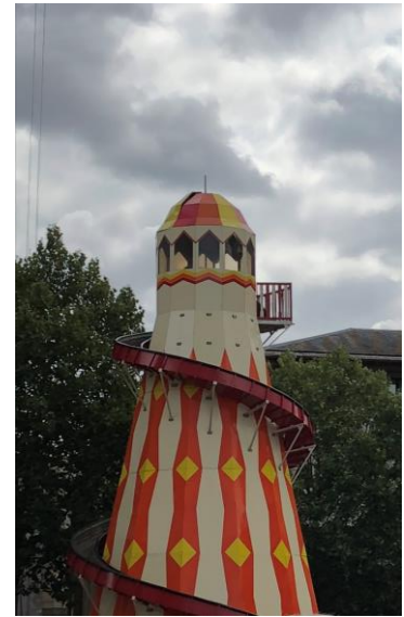
Helter Skelter in West Smithfield

Bompass and Parr's Gallivanting Gateau kept behind bars on Saturday and let loose, somewhat scarily, on Sunday to move around the Market dispensing sachets of sherbet if you were brave enough to operate the lever!